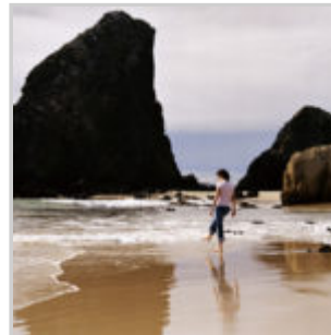
Rocks on beach