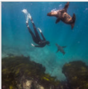
Diving with seals