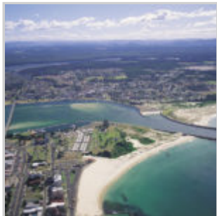
Forster/Tuncurry aerial shot